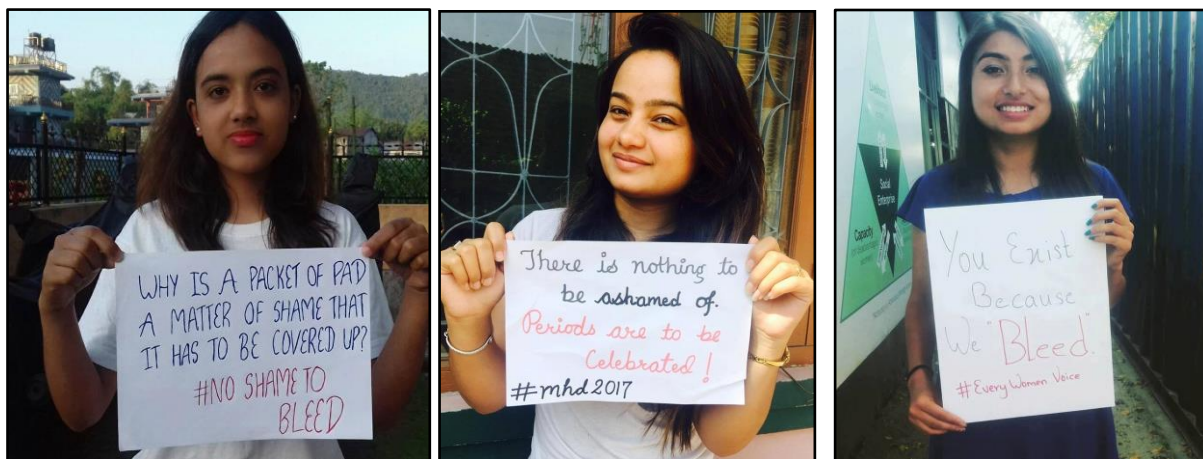
✚ MHM Practitioners

To encourage open messaging about menstruation, a social media photo contest was organized, where the participants had to post a picture on the organization's Facebook page with a message. The message were judged on the basis of the message and the vote received, and the winning photo was awarded.