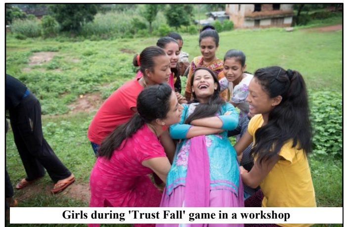
Girls during 'Trust Fall' game in a workshop

Since February 2016, with support from Accountability Lab, Visible Impact has been implementing “Girls: Better After Quake” program in Kharanitar village of Nuwakot district. Using girl centered program design, Visible Impact organizes monthly workshops, safe space meetings, and community events. It had completed one year of mentorship with fifteen earthquake affected adolescent girls in