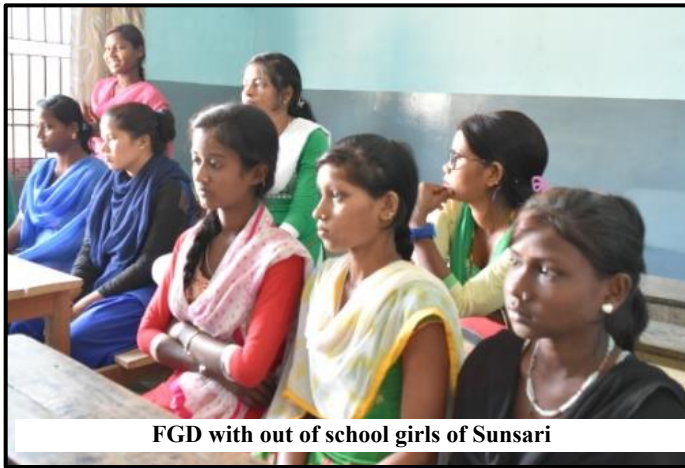
FGD with out of school girls of Sunsari

information on the CSE learning provisions for out of school children. The data and case stories that have been generated through both the researches will serve as an important tool to influence the policy makers at the national level, by demonstrating the latest situation and experiences of young people from various parts of the country.