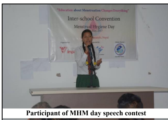
Participant of MHM day speech contest

With the aim of encouraging adolescents to speak about menstruation amidst their friends, teachers and classmates, the Inter School Speech Competition on the topic "Let's talk about menstruation" was organized. Participants from 8 different schools spoke for 5 minutes about the problems they have faced for being shy about menstruation and urged the audience to talk about it freely and openly. The girls raised their concern on the restrictions they face at home, the lack of space for open discussion about menstruation, limitation of the curriculum to highlight the actual need to the girls and the age appropriateness of the curriculum, the need to make the school menstrual health friendly and urged the audience to discuss openly about menstruation. The real life experience they shared was relatable by most of the participants, as expressed by them after the program.