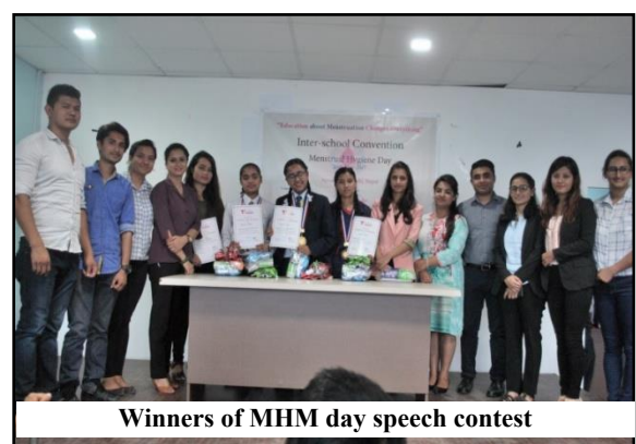
Winners of MHM day speech contest